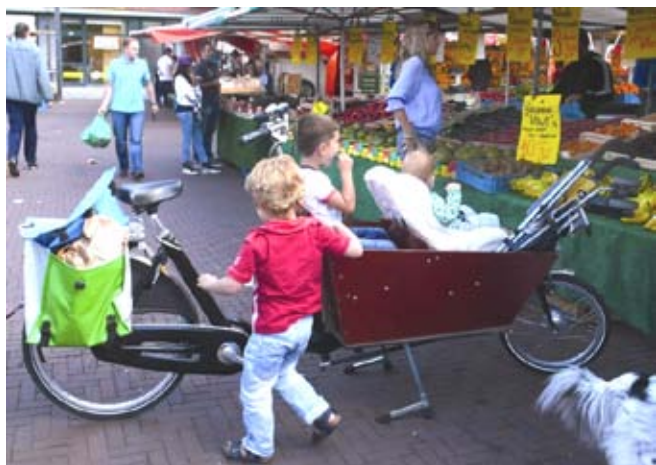
Shopping by bike with kids

crease by just 1 %, an additional revenue potential of 0.2 % would be generated for local retailers. This is attributable to the relocation of shopping trips from shopping centres on the outskirts of town. In the medium term, a 10 to 15 % reduction in the number of shopping trips made by car to the outskirts of town is realistic. As a result, an additional maximum revenue potential worth a total of EUR 1.3 million is estimated for the local retail sector if they succeed in encouraging customers to shop by bike near their homes.