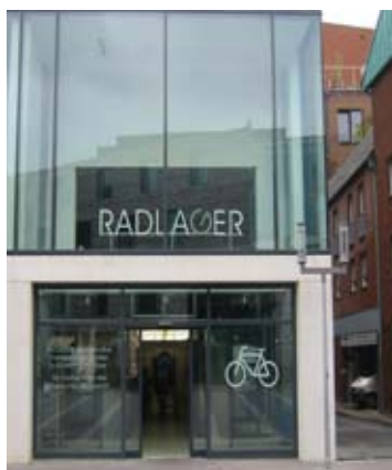
The newly built bicycle garage in the centre of Münster

Services offered in shops and city centres meet the needs of cyclists by providing them with tyre pumps,