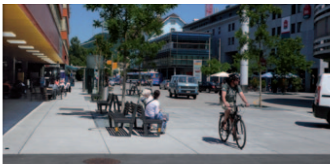
'Encounter zone' of the station forecourt in Baar, Switzerland

Mixed-traffic areas have been tested extensively with up to approx. 4,000 motor vehicles per day. Recommendations do not rule out traffic situations with up to approx. 18,000 motor vehicles per day. For larger intersections a roundabout at the edge of the shared-space with the main pedestrian crossing can direct some traffic away from the pedestrian traffic. For streets with a high motor-vehicle density, a central island allows pedestrians to cross in two stages. A special metering light can be used for controlling the number of cars that enter certain sensitive areas.