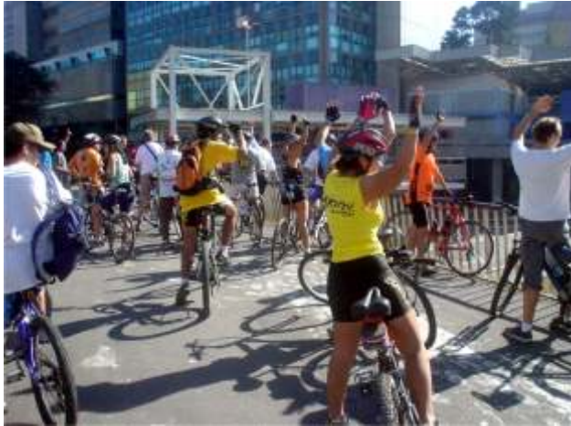
Brazilian Bicycle Advocacy Meeting 2006 bike-ride in São Paulo, July 2006