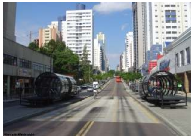
Curitiba BRT System (FERREIRA, 2006)

The single project that most contributed to improved quality of life in Bogotá was the bus-based transit system called TransMilenio. The BRT System is based on specific lanes for bus flow, inspired by the Curitiba system in Brazil.