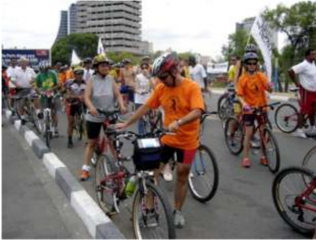
Critical Mass Bike-ride in World Social Forum 2006 Porto Alegre