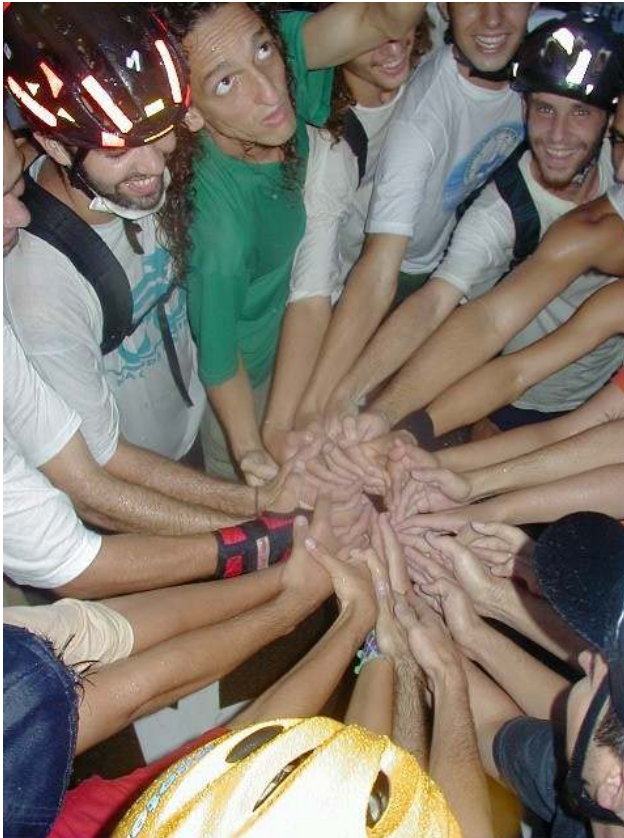
Bicicletada Floripa (Brazil), critical mass