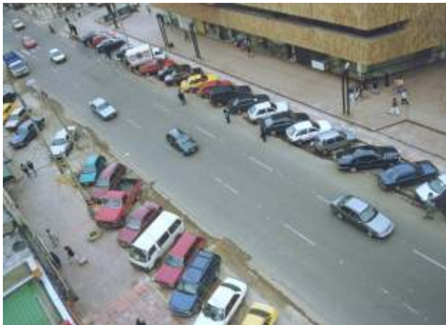
15th Avenue Before

1. Turning car parks into sidewalks and cyclepaths;