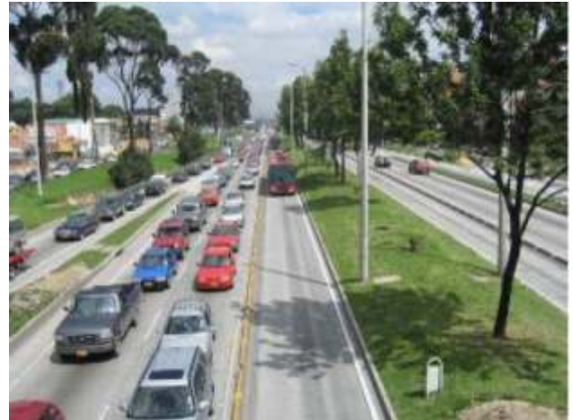
TransMilenio - Bogotá (FERREIRA, 2006)

Bogotá (Colombia) is by far the city that has implemented the most comprehensive changes in just a few years, showing the usefulness of linking transportation improvements to social and other issues involved in modernization and urban progress.