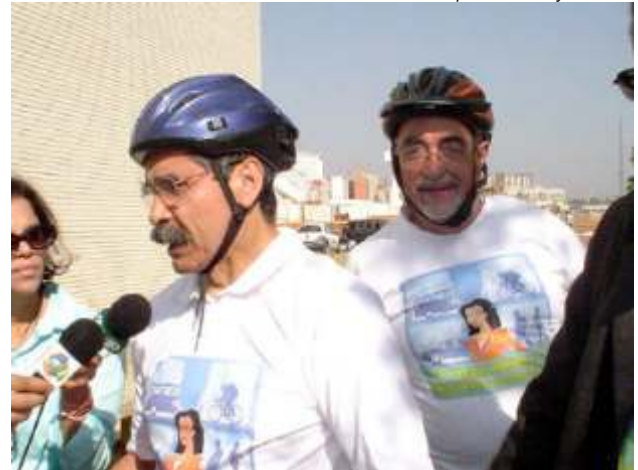
Bicicleta Brasil Launching. Minister Dutra and Bianco

Architect/Advocate who passed away in 2006