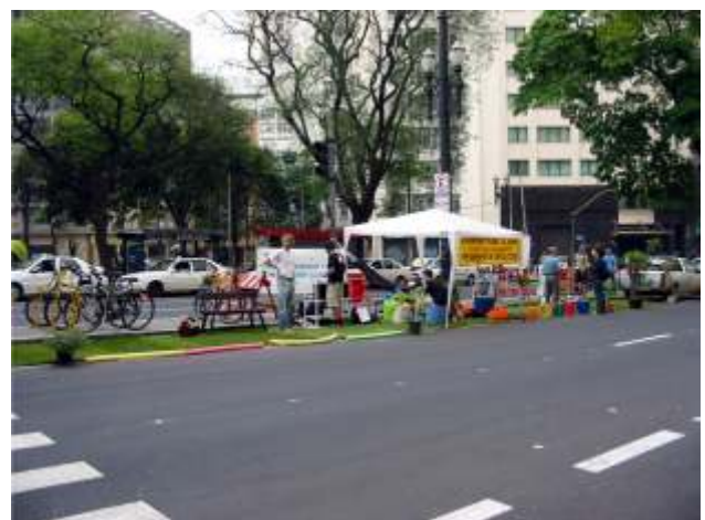
Vaga Viva in 2006 Carfree Day (São Paulo, Brazil)