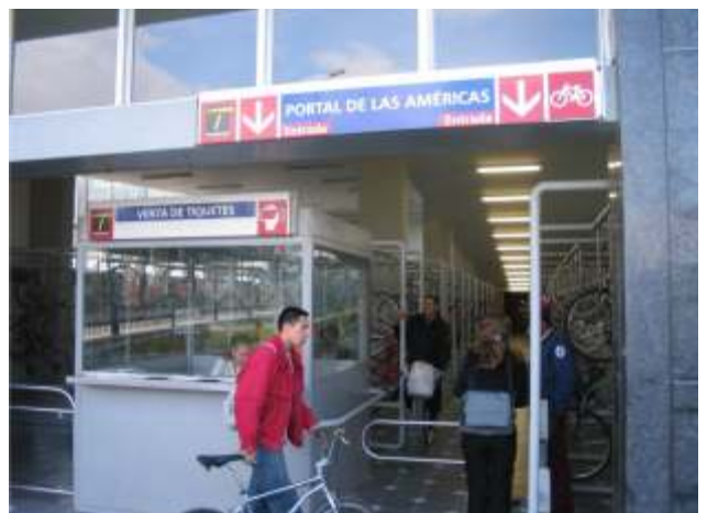
TransMilenio Bike Parking

The main pro-bicycle non-governmental organizations that have contributed to Bogotá’s success in cycling are Fundación Ciudad Humana ( www.ciudadhumana.org ) and Fundación por El País que Queremos PPQ ( www.porelpaisquequeremos.com ). FCH has been playing an important role in the creation of Ciclovías Unidas de las Americas network.