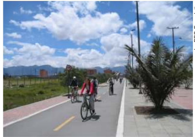
Alameda El Porvenir

And the 45-km greenway with more than 400