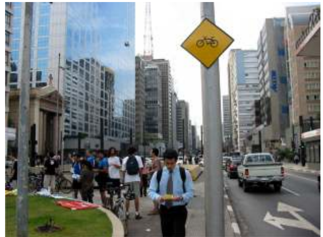
Bicyclist's Square before monthly CM ride (São Paulo, Brazil)

The critical mass group, Bicicletada ( www.bicicletada.org ), has been organizing manifestations every month. Despite monthly rides are not massive (20 to 40 participants on each ride), Sao Paulo Critical Mass has been making creative and educational activities to promote bike use. On February 2006, realizing that their meeting point has no official name, the participants named the space (in one of the most important and jammed avenues of the city) as Praça do