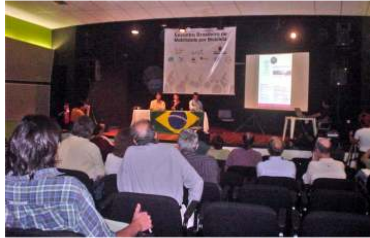
Brazilian Bike Advocacy Meeting SP 2006

third place. In the second place comes India, with an annual production of 10 million (8,3% of total); and the world's producer and consumer of bicycles is China, with 80 million units per year (66,7% of total). Other countries together produce other 25 million units (20,8% of world's production).