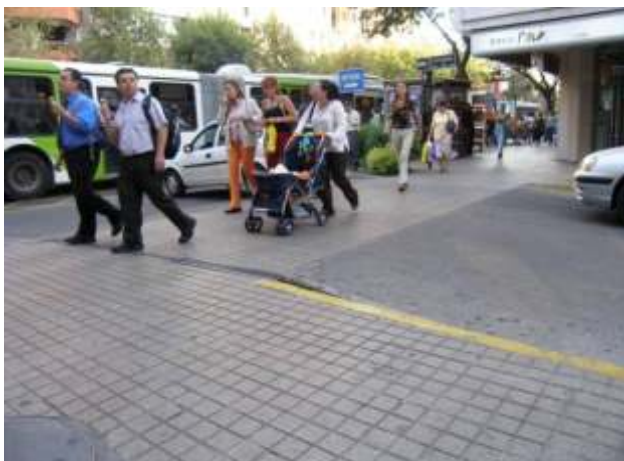
Alameda and calle Ejercito (Santiago, Chile)