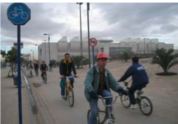
Tindal Public Library

More than 1,200 parks (from very large to extremely small) were built all over the city.