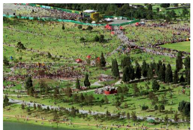
Simon Bolivar Park