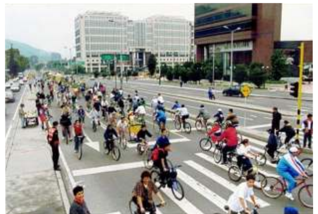
Bogotá Sunday Cycleway (FERREIRA 2006)

In this short time, around 1,5 to 2 million people among pedestrians, cyclists, skaters, roller users etc, “take control” of the public ways to celebrate life (FERREIRA, 2006).