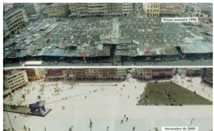
San Vitorino Plaza before (in 1998) and after (in 2000)

San Vitorino plaza had been completely taken over by vendors. This was 22 hectares of what was probably the most deteriorated urban space in the world-teeming with drug distribution, criminal organizations and drug addicts-was demolished to make room for a massive park. Although this was only two blocks away from the Presidential Palace and the historical and institutional center of the country, it had the highest murder rates in the country, which plummeted after the demolition (PENALOSA, 2005).