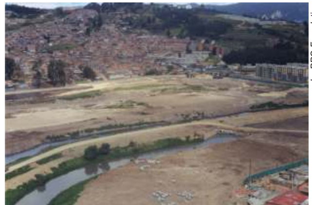
Juan Amarillo Wetland Before