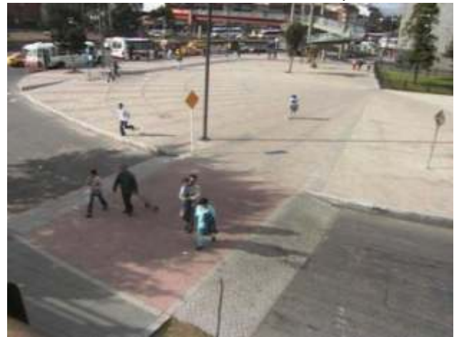
Bogotá – cycle path and sidewalk - the infrastructure design tells the motorists they have to slow down