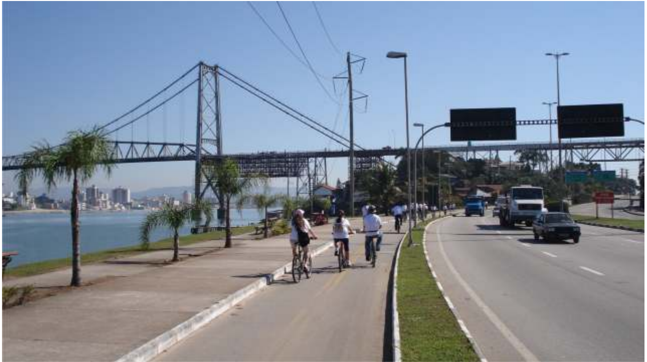
by Antonio Miranda, 2006

The city of Florianópolis, has around 22km of disconnected cycle ways, mostly used for leisure, 2% of daily trips are made by bicycle