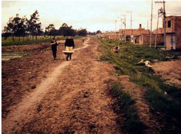
Franja Seca canal Before