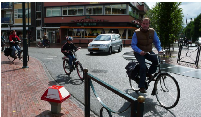
Roundabout in Haaren (Netherlands)

There are currently two options to provide for cyclists on roundabouts: on-carriageway cycling or separate cycle paths and/or shared cycle and pedestrian paths. For safety reasons, on-carriageway cycle lanes and protection lanes must not be provided on roundabouts. The Recommendations for Cycle Facilities (Empfehlungen für Radverkehrsanlagen, ERA) issued by the Road and Transport Research Association (Forschungsgesellschaft für Straßen- und Verkehrswesen, FGSV) include cycle integration options for roundabouts. The various types of roundabout are dealt with in more detail below.