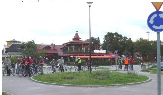
Roundabout just for cyclists in Danzig (Poland)

motorised traffic since 2011. A roundabout just for cyclists has been introduced in Gdask, a Polish city on the Baltic coast where a number of cycle routes meet that are very busy in summer.