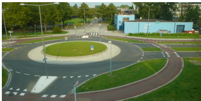
Roundabout in Rotterdam (Netherlands) with a segregated cycle path

should be applied at a distance of about 10 metres behind the splitter island. Separated cycle paths should already be truncated on approach arms, so that cyclists join the carriageway. This requires infrastructural facilities for protection at the end of the cycle path followed by a short strip of protection lane.