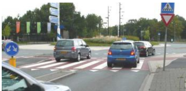
Turbo-Roundabout in Hilversum (Netherlands)

Roundabouts with two lanes may achieve better capacity for motor-vehicle traffic, but also introduce accident risks to cyclists. Similar to the situation at roundabouts with excessive lane width, turbo-roundabouts are not suitable for on-carriageway cycling. Consequently segregated cycle paths around the outside of the roundabout are recommended by the ERA. The questions whether priority should be given to cycle path users and whether a second level (underpasses for cycling traffic) might be appropriate in some cases are contested, especially in the Netherlands, because so-called turbo-roundabouts are very rare.