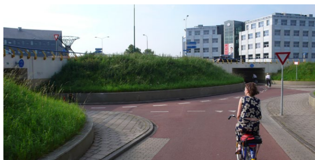
Separate level for cycling traffic in Houten (Netherlands)

Mini-roundabouts with an inscribed circle diameter between 13 and 22 metres are mainly used in the minor side road network with narrow roads. Mini-roundabouts have coloured central markings or a raised central island capable of being driven over by motor vehicles.