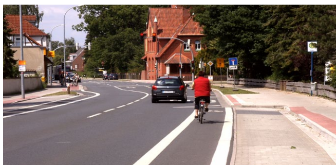
Cyclists are obliged to use the cycle lane; riding of motor vehicles on them is not allowed

The provision of optional shared-use pedestrian and cycle paths allow for faster cyclists to join the carriageway and at the same time provide a separated space for insecure and slower cyclists, such as elderly people for example. This is indicated through a 'cyclists allowed on pavement' sign ('Gehweg, Radfahrer frei'); the blue cycle sign for paths that cyclists are obliged to ride on is not used.