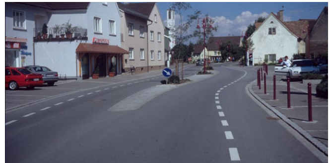
Protection lanes in both directions of a through road

In Germany, as in many other European countries, so-called protection lanes are used more and more, especially in narrow road cross-section situations. The protection lane serves as an eye catcher to draw the attention of car drivers to the potential presence of cyclists; it indicates the lane suggested for cyclists on the carriageway, but is not exclusively reserved for cyclists. Riding of motor vehicles on them is allowed where necessary