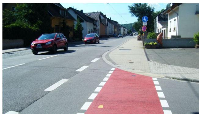
Off-carriageway cycle traffic must be able to cross a side road safely.

Visibility must not be obstructed before the side road so as to ensure that turning drivers see the cyclists travelling on the segregated cycle facility in good time. To facilitate this, it is advisable to bend in the cycle path towards the edge of the carriageway before the side road. Where the cycle path is continued across the side road, protection and give-way markings should be provided to indicate that, as is normally the case, priority is given to cyclists going straight ahead along the main road. This applies especially to situations with two-way cycle paths with a greater risk of accidents.