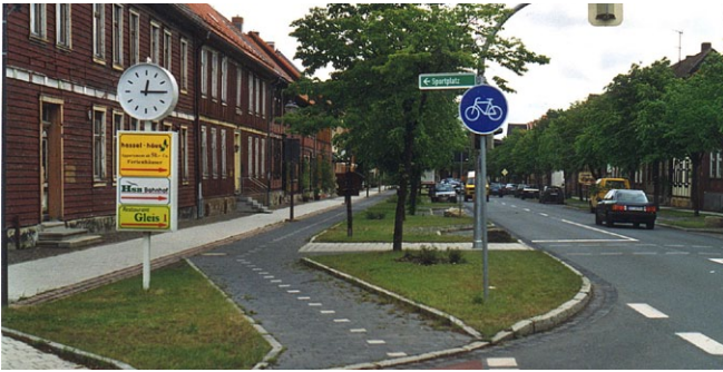
Two-way cycle paths require appropriate widths and protected crossings of side roads

On a clearly segregated, two-way cycle highway running around the outside of the roundabout, cyclists may be given priority over minor side road traffic.